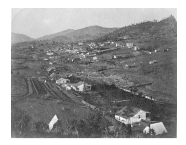
Bancroft Library Photograph

This photograph, probably taken late in 1860, shows the sign mentioned by King.