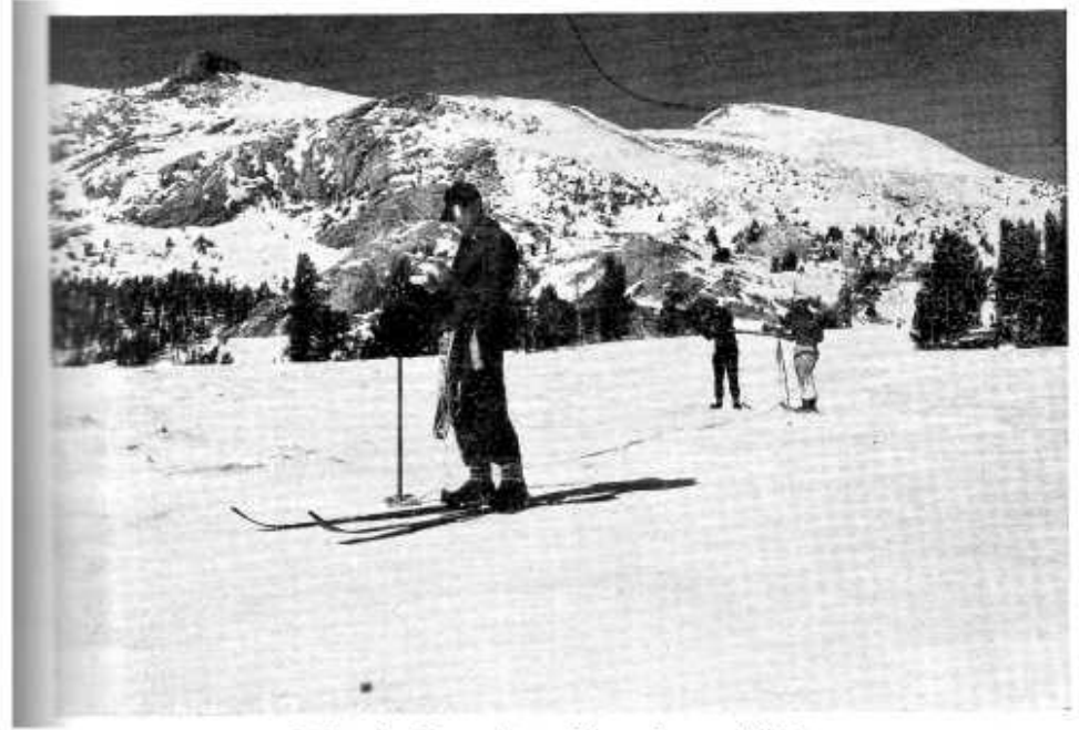
Skiing in Yosemite - December until May