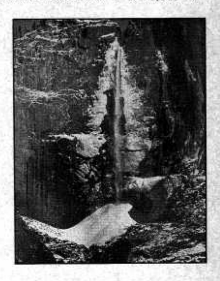
Upper Yosemite Fall and Ice cone.

the salamanders. It will be interesting to see if the lower boundary of the salamander range cannot be pushed down to Yosemite Valley—perhaps to the snow bank at the base of middle Cathedral Rock. Thus the altitudinal range can be given at least from 5140 ff. to 10,800 ft.