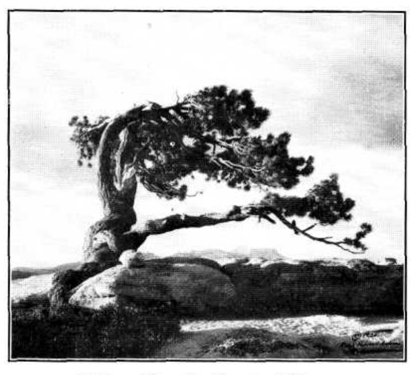
Jeffrey Pine On Sentinel Dome