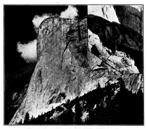
El Capitan Showing "Map of North America" and El Capitan pine

We soon cross the Merced River on the Pohono Bridge and meet the