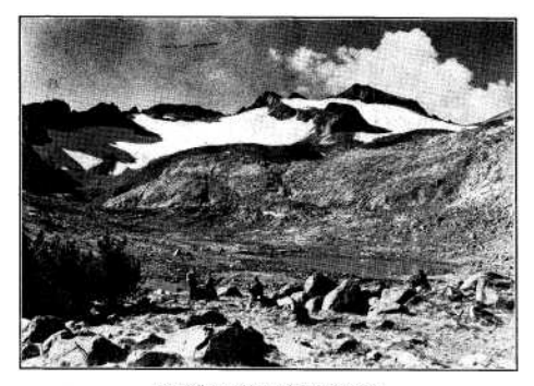
Mt. Lyell (13,095 ft.) and the Lyell Glacier

Yosemite Valley, with an area of approximately seven square miles, is but a small part of this national park, whose boundaries embrace 1.189 square miles—roughly, about the size of Rhode Island. Over excellent highways one may reach Tuolunne Meadows and famed Tioga Pass, the Mariposa Grove, finest of three groves of big trees (Sequoia gigantea) in the park, and Glacier Point where a matchless, breath-taking panorama of the valley, the Clark Range and the Sierro cress is Jound.