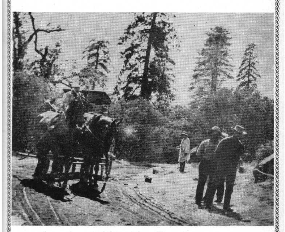
Stagecoach Holdup - Raymond-Wawona Road 1905