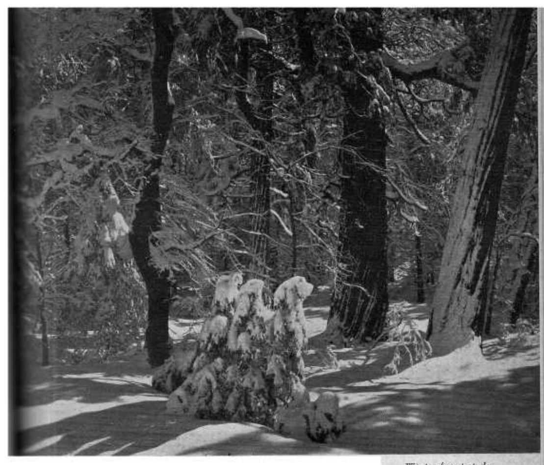
Winter forest study ---Ansel Adams