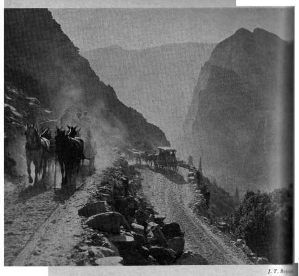
Stagecoaches on old Big Oak Flat Road, Yosemite Valley, 1903.