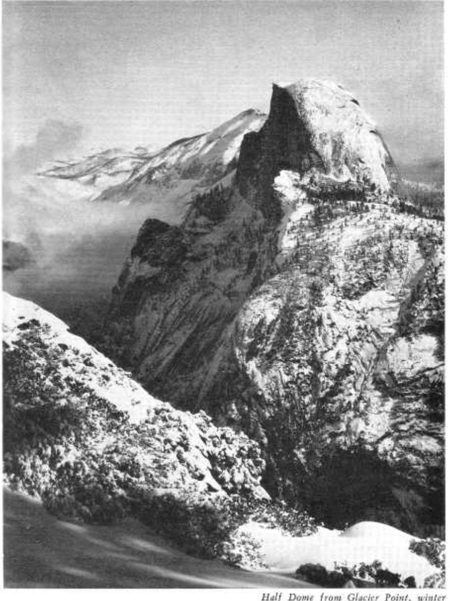
Half Dome from Glacier Point, winter —Ansel Adams