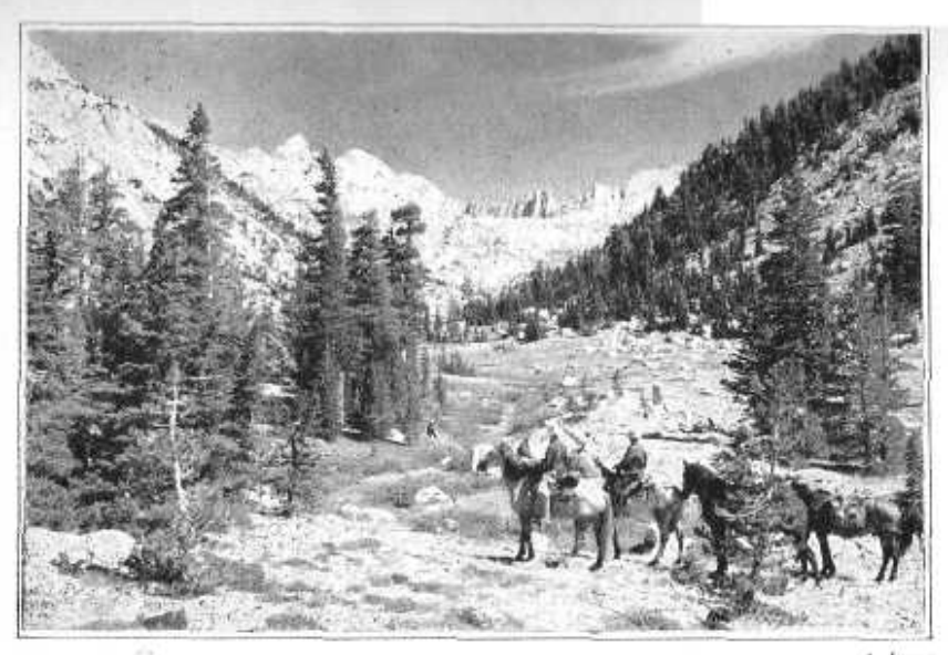
Anderson Matterhorn Canyon, with Burro Pass and Sawtooth Ridge in distance.

On the second day of our Sawtooth visit, some of us headed down Slide Canyon to see the tremendous rockslide which had given the gorge its name. For about its first two miles. Slide Canyon runs directly west, then turns abruptly to the southwest. Just beyond this turn, Slide Mountain towers nearly 2,000 feet above the canyon floor. In fairly recent times, possibly around a hundred years ago and before the first white man had explored there, a huge portion of the mountain broke off and crashed down into the canyon. To us the slide appeared almost as fresh is if it had occurred only a few days before. The face of the mountain showed a great naked scar, down which the slide had come. The canyon floor, which was about a guarter of a mile wide, had been filled with enormous boulders for about half a mile of its length. It was impossible for us to cross the slide, since many of the granite blocks were the size of small houses. and all of them were piled in com-