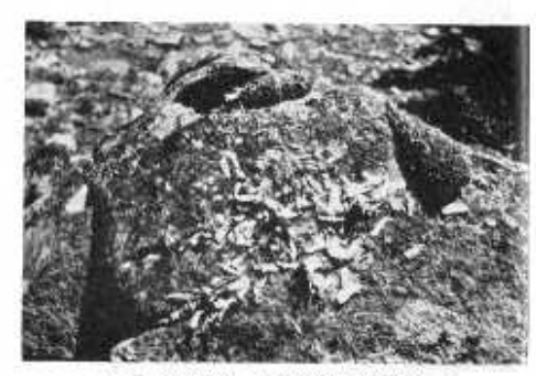
Chickaree's kitchen midden

As a result of the chickaree's dining, a small heap of cone scales is left on the forest floor, resembling a carpenter's pile of wood shavings. What remains of the axis of the pine cone is something that looks very much like a corn cob. These accumulations of litter are commonly known as "kitchen middens," and when they are found they are good evidence of the presence of the chickaree bombardier.