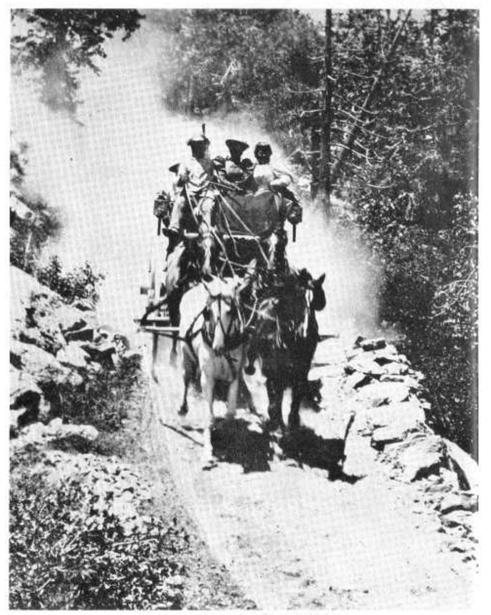
Staging on the road to Yosemite Valley.