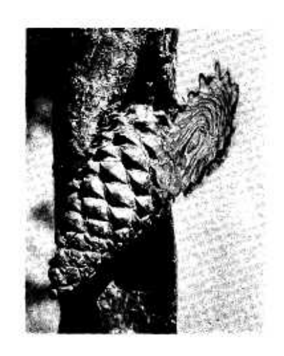
Knobcone with ingrown cone

4th. The cones never fall off and never discharge their seeds until the tree or branch to which they belong dies."