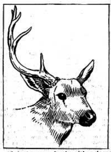
"I just saw a buck with a large antler on one side of his head and no ant'er at all on the other

horns hardened. When the Horns Are "In the Velvet" In a few weeks after antiers have teen shed, new ones begin to grow At this season the surplus strength of does goes to their unborn young; that of bucks, to their developing antiers. At first the new antiers are soft and plastic. They are covered with a soft integument commonly known as "velvet," and are richly supplied with blood and nerves. They are of course sensitive as well as soft, and accidents that they meet with during this period may cause them to take period may cause them to take permanent freak shapes. By Septake