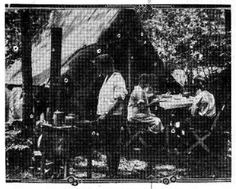
"tudents may do their own cooking.

Term Regular instruction is given from June 26 to August 6, coinciding with the University of California summer session at Berkeley; high mountain field trip August i to 12, 1927. Teaching Stuff