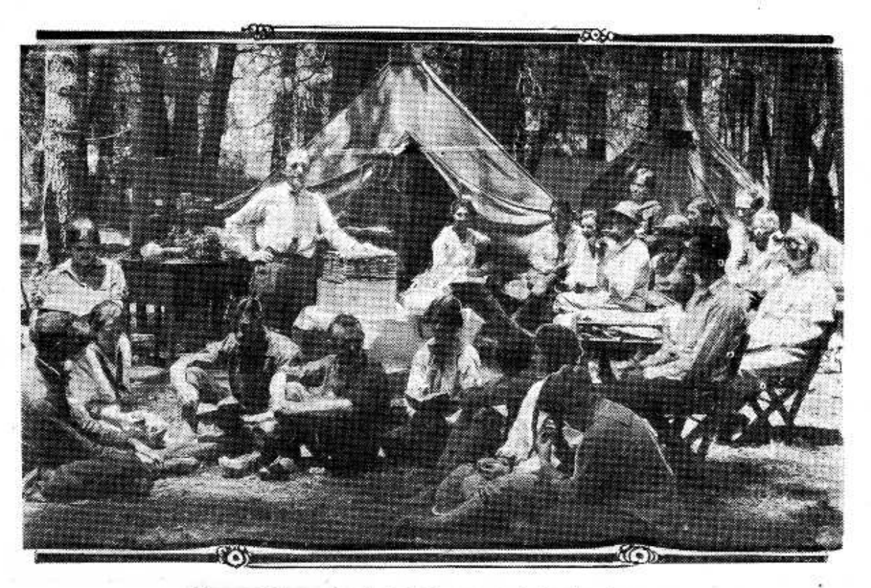
The central camp for students has proven to be advantageous.