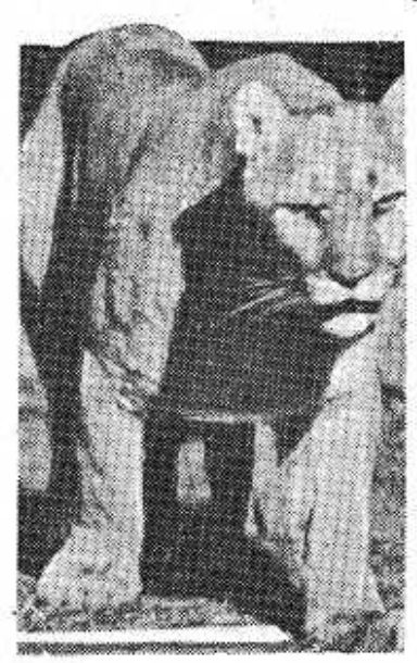
A California Mountain Lion

EXPLANATORY LABEL PLACED WITH CAGED LIONS